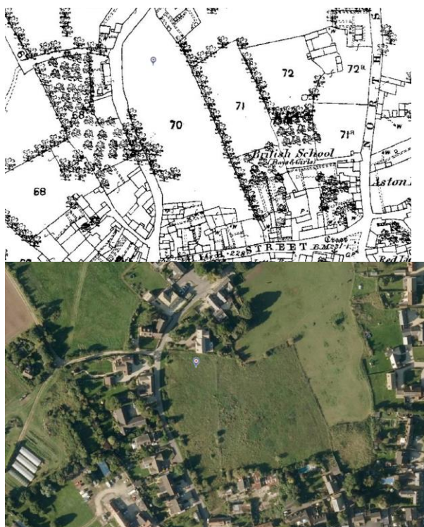
OS Map 1875 and aerial view (2018) – showing the open character of this landscape since at least the 19 th century

The proposal is for the erection of a detached dwelling and carport/garage and workshop with home office above.