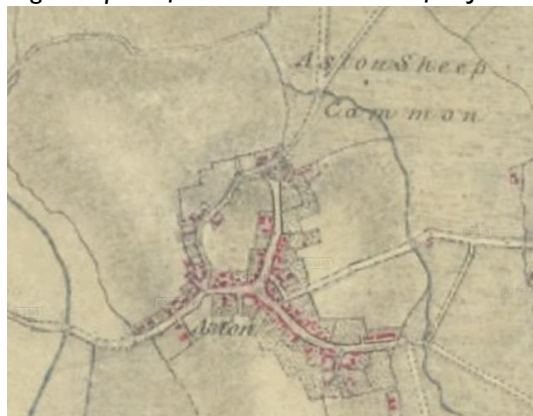
Maps from OldMapsOnline - William Stanley 1821